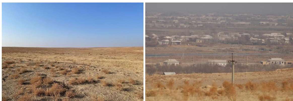
Figure 2-1. View to the centre of the site (Left) and Zarafshan river to the north of the site (Right)