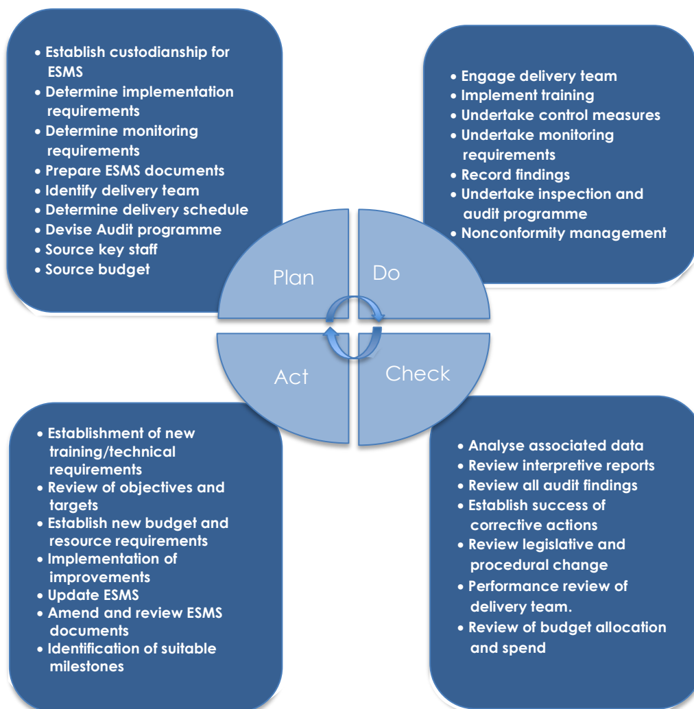
Figure 3-1 Implementation Process

An outline implementation process for ESMS is illustrated in the figure below.